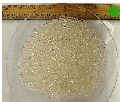
View of content