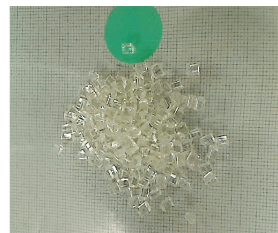
3908.1mg analyzed (1mm x 1mm scale)

Disclosures: All work was done at Beta Analytic in its own chemistry lab and AMSs. No subcontractors were used. Beta's chemistry laboratory and AMS do not react or measure artificial C 14 used in biomedical and environmental AMS studies. Beta is a C14 tracer-free facility. Validating quality assurance is verified with a Quality Assurance report posted separately to the web library containing the PDF downloadable copy of this report.